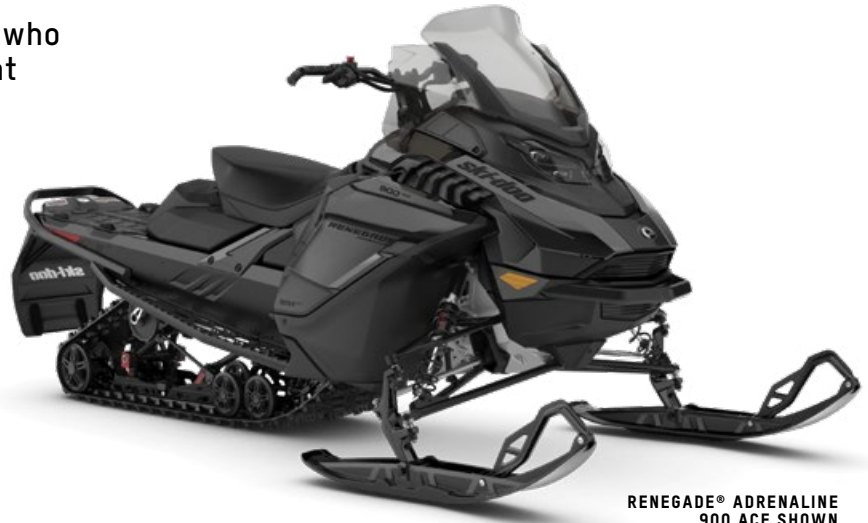
RENEGADE® ADRENALINE 900 ACE SHOWN

For the experienced trail rider who wants a longer track with great traction to bridge bumps with dynamic 4-stroke engine.