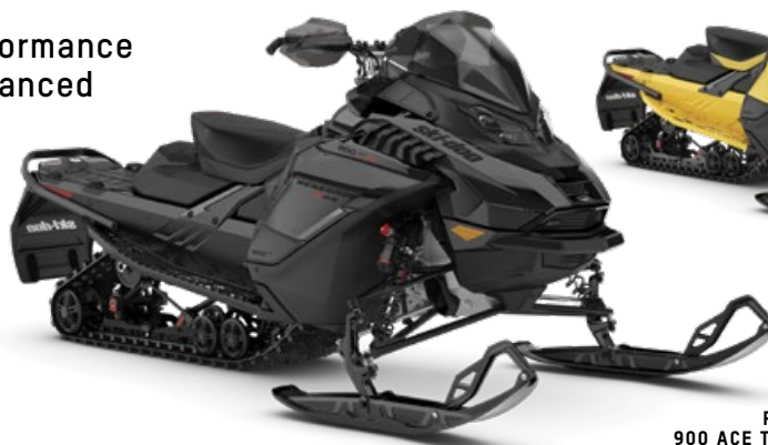
RENEGADE X-RS 900 ACE TURBO R SHOWN