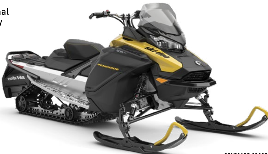
RENEGADE SPORT 600 ACE SHOWN

Value-oriented with exceptional trail handling, bump capability and reliable engine.