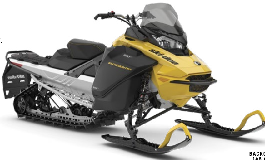
BACKCOUNTRY SPORT 146 600 EFI SHOWN

For the value-oriented 50-50 rider wanting an advanced platform and modern engine technology.