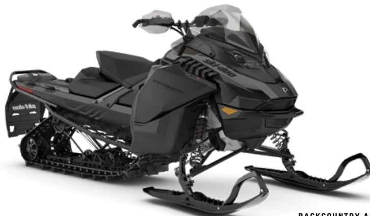
BACKCOUNTRY ADRENALINE 600R E-TEC SHOWN

Loaded with crossover-specific features for spending equal time riding on- or off-trail.