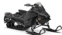
BACKCOUNTRY X-RS 146 850 E-TEC SHOWN