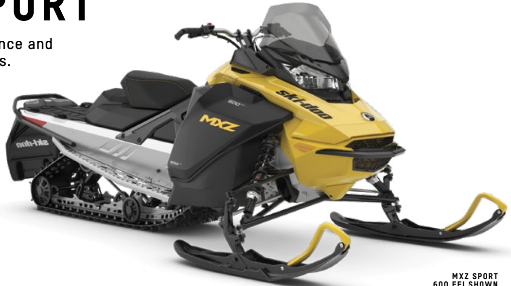
MXZ SPORT 600 EFI SHOWN

Dynamic trail performance and value-oriented features.