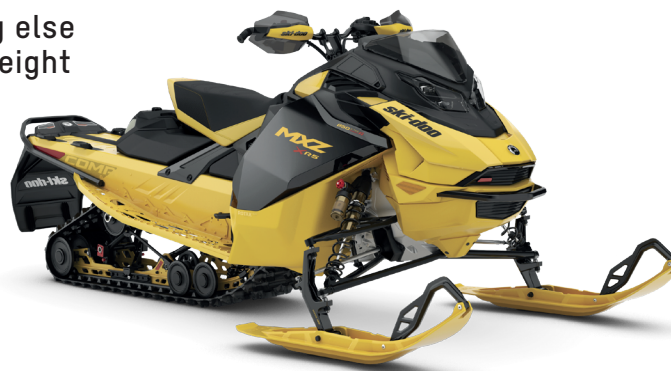
MXZ X-RS 850 E-TEC TURBO R WITH COMPETITION PACKAGE SHOWN