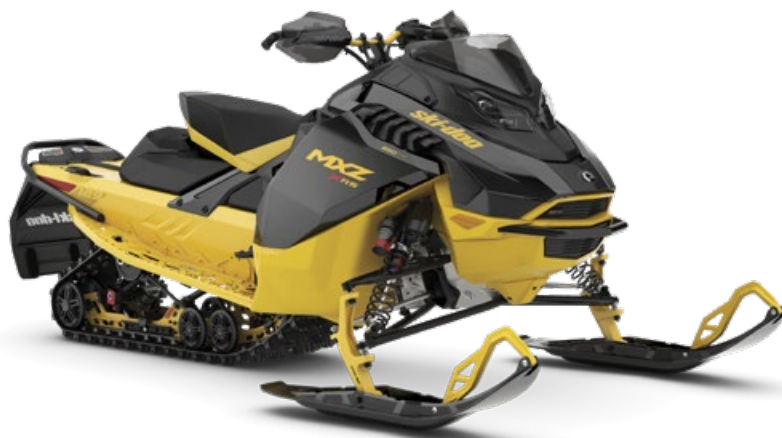
MXZ X-RS 850 E-TEC SHOWN

A non-compromising race-inspired sled capable of taking on the roughest trails with ease.