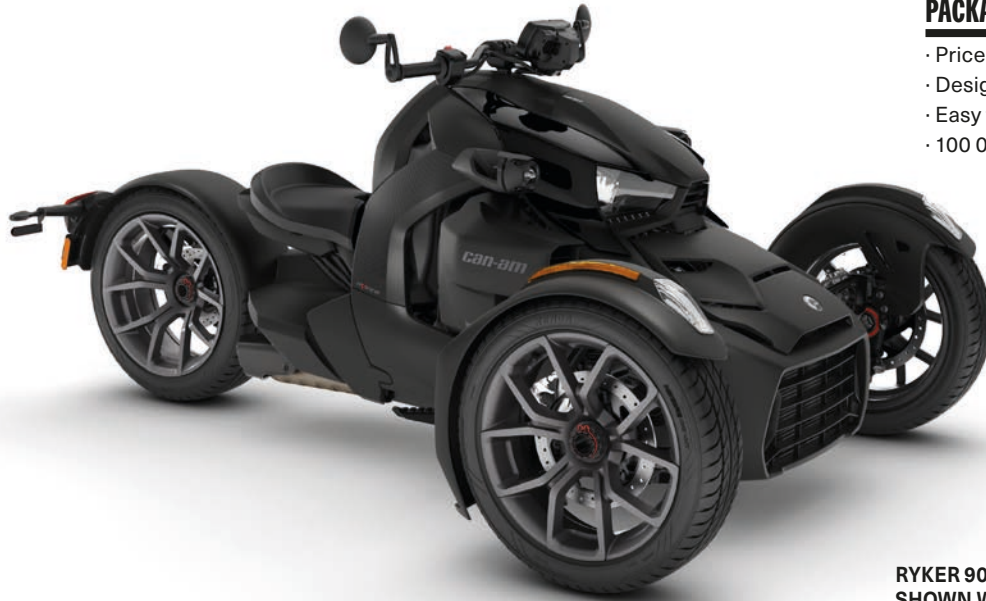
RYKER 900 SHOWN WITH INTENSE BLACK PANELS