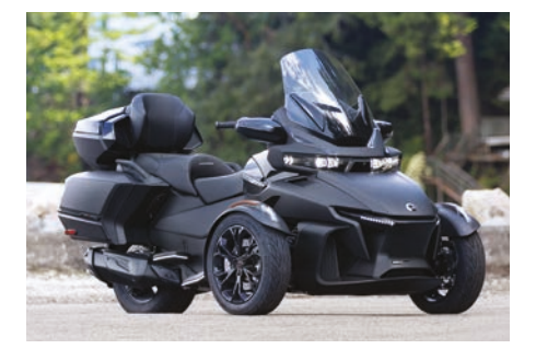
SPORT STYLING Modern design with a sleeker look for sport style enthusiasts.

A high-resolution infotainment system that puts an interactive, informative and customizable experience that's both seamless and simple, right at your fingertips.