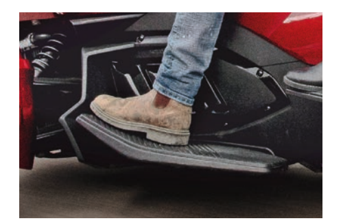
TOURING FLOORBOARDS With the 58.4 cm (23 in.) touring floorboards, riders can now sit however they are most comfortable and change leg positions on long rides while enjoying easy access to the brakes.