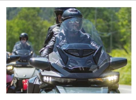
PREMIUM LED HEADLIGHTS Premium LED headlights leave nothing hidden around the next turn with improved road visibility and precision lighting.