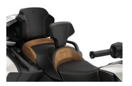
ULTRA COMFORTABLE SEATS Ride long distances in comfort with the ultra comfortable adaptive foam seats, stylized with a Sea-to-Sky embroidery. On colder days, keep warm with the heated feature.