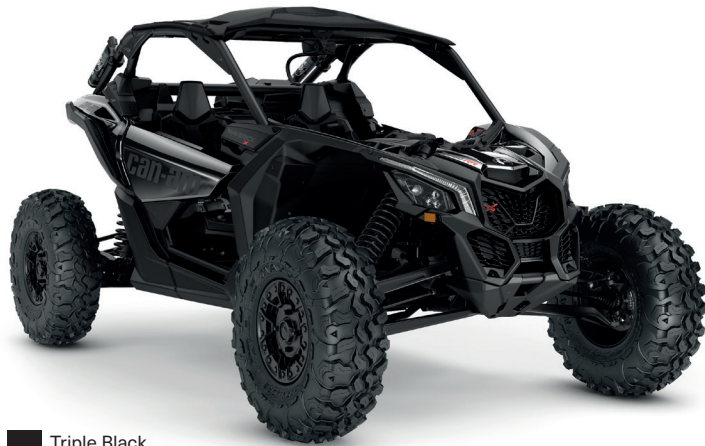
■ Triple Black