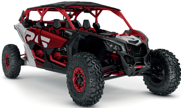
Fiery Red - Hyper Silver