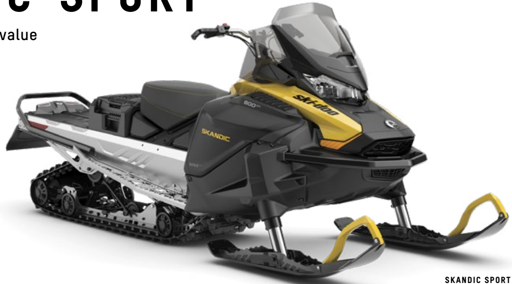
SKANDIC SPORT 600 EFI SHOWN

The best 20-in. utility value in snowmobiling.