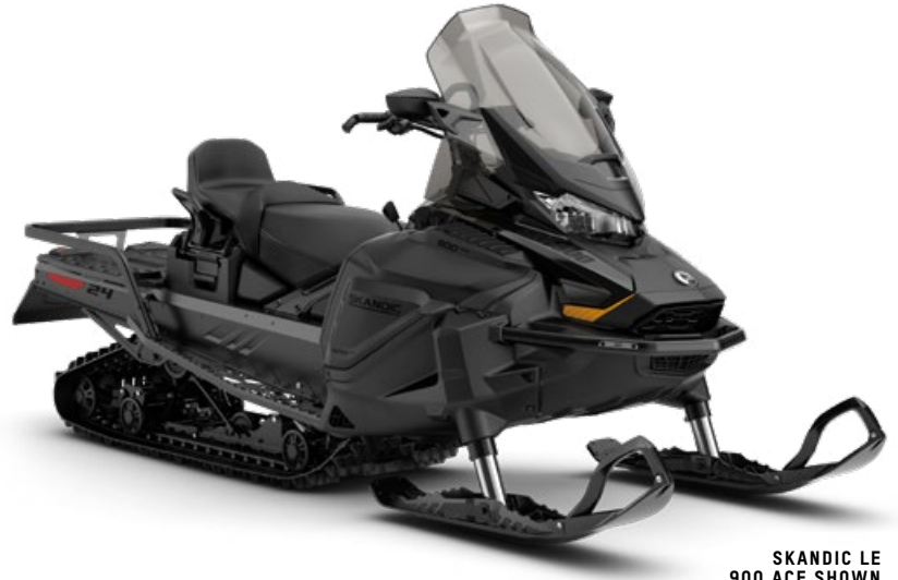
SKANDIC LE 900 ACE SHOWN

The perfect snowmobile for hardworking off-trail performance.